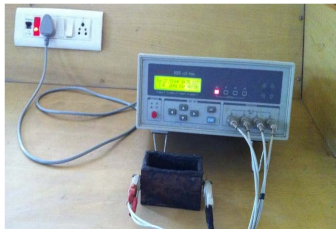
Fig. 2: Experimental set-up with the capacitor box

From equation (4) it is seen that the dielectric constant of soil with different soil moisture content can be determined experimentally by measuring the capacitance values. This way the measurements of dielectric constants for various soil samples are done in the study.